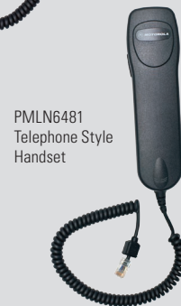
PMLN6481 Telephone Style Handset