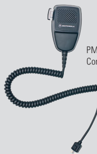
PMMN4090 Compact Microphone