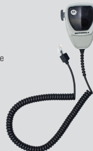
PMMN4091 Heavy Duty Microphone