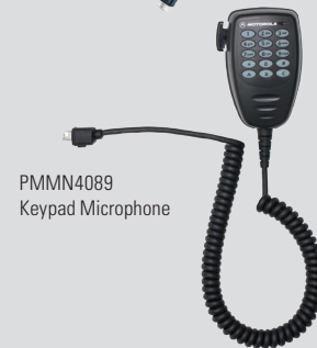
PMMN4089 Keypad Microphone