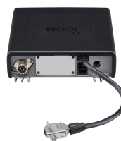
Optional OPC-1939 installation image