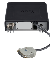
Optional OPC-2078 installation image