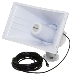
Additional PA Horn Speaker