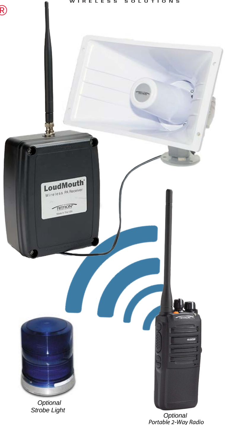
Optional Strobe Light