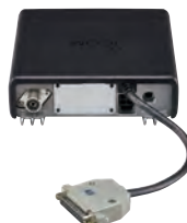
Optional OPC-2078 installation image