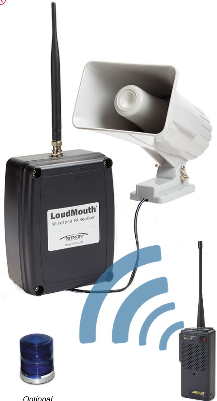
Optional Strobe Light