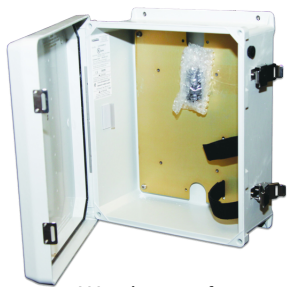
Weatherproof fiberglass housing