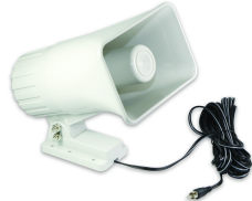
Additional PA Horn Speaker